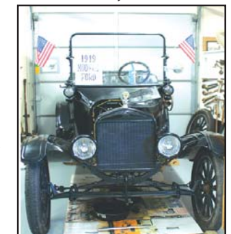
1919 Model T Ford

been over there yet. I told him they were on my list. He said when they moved the depot in he thought why would you do that nobody will stop there. He stated that over the years he has been surprised by the number of cars that have visited.