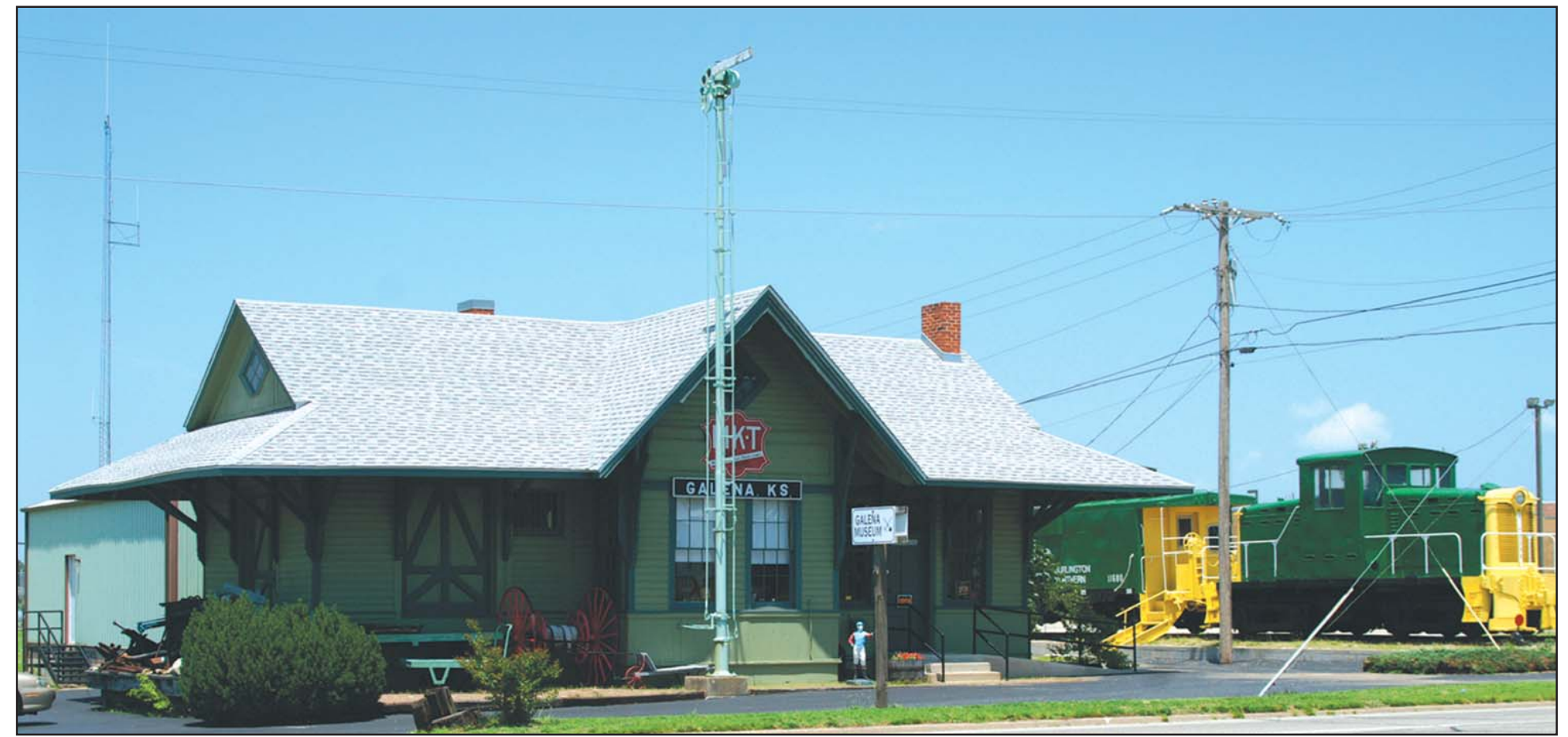
Old KATY Depot used for the Galena Museum facing Route 66

Currently three old men and a young couple are the volunteers at the Museum, with the young couples ages 67 and 63. They are open Monday through Saturday from 9:00 a.m. to 11:30 a.m. and 1:00 p.m. to 3:30 p.m. Sunday is by appointment only. There is no admission charged but donations are accepted. The Museum is located at 319 West 7th Street which is Route 66.