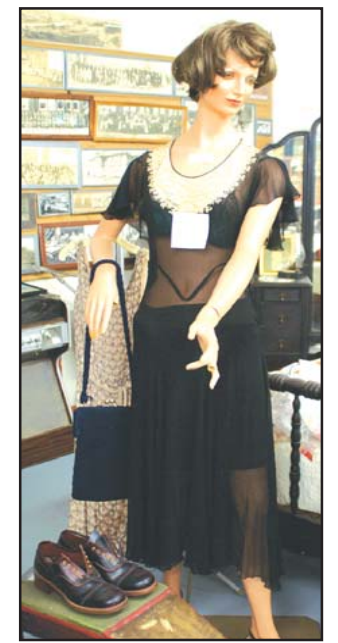
A dress that was worn by in 1927 she was a resident of Galena.