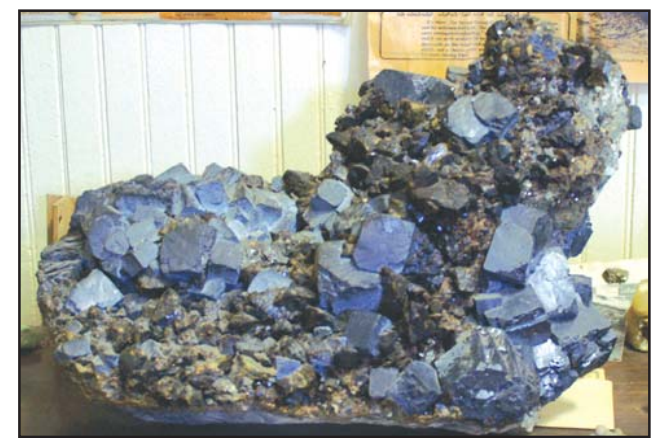
A mineral specimen of Galena (Lead) and Sphalerite (Zinc)